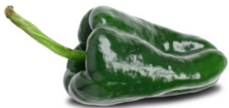
1 pepper (hot or mild)