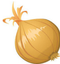
1 onion, diced