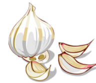
1 garlic clove