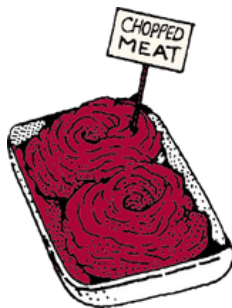
1-2 lb. ground meat