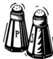
salt & pepper