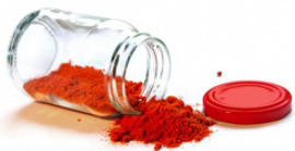
2-3 T. chili powder