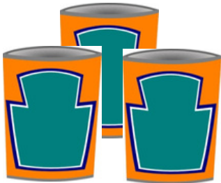
2-3 cans beans or 1lb dried beans, cooked