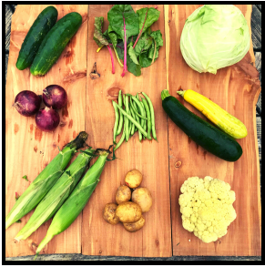
images represent variety not quantity