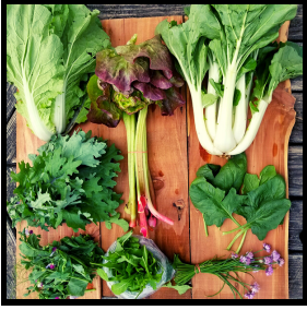
images represent variety not quantity